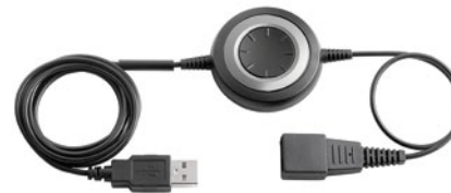
Jabra LINK 280