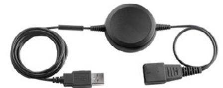
Jabra LINK 220